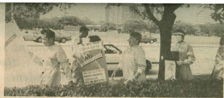
Demonstrators donned surgical gowns