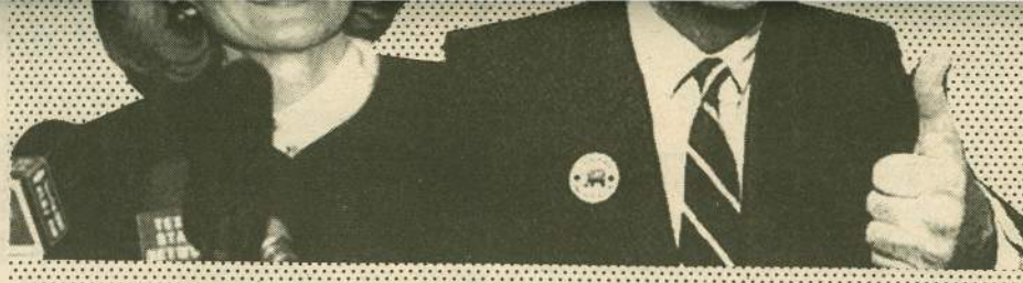
U.S. Senators representing Texas