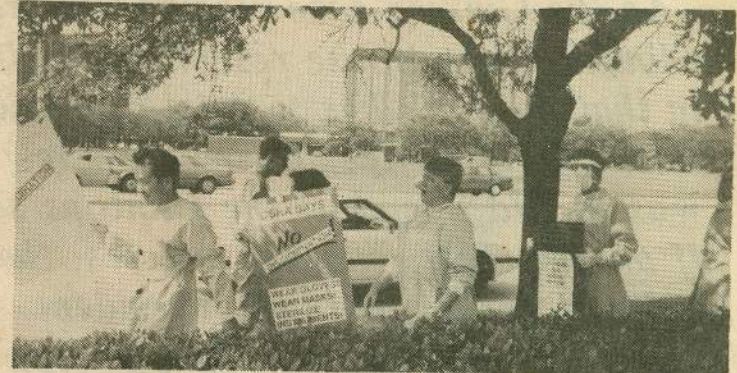
Demonstrators donned surgical gowns

Castle claims that it is not prepared to protect its employees from HIV infection, and thus can not accept infected clients. Act-Up counters that if the clinic were following federally prescribed "universal precautions" for all contagious diseases, HIV would not be an issue. Act-Up further charges that if such guidelines are not being followed for HIV, Castle clients may well be at risk for other contagions.