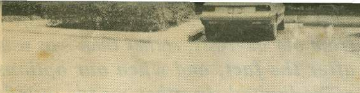
Galleria area Castle

aimed ances 9 with (713) resents ion of 2540 ne 5 - VAL - e. All nter of metry ea and nce on usical, t., 6/12 6/16 at en," an scripts ivities, m and 12 ($6 dents) 5 Main, une 5 - @ Oak cing a through Tickets essner, friends through at 3pm. 1001 "Ariel," uest for pm and about a npts at pm and Home y and a on 6/13, ($4 - on the Blvd @ 10 with Gregory nlines of pm, and t Finney nriage, n., 6/13, t. Noam t original and an Gerard comedy, d drifter he Last ising an asculine women. ge 35