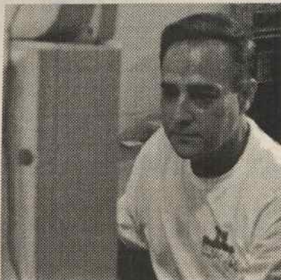
Montrose TV shows last episode.

TV Montrose signs off with sad good-byes