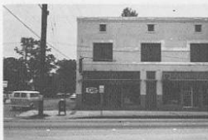
Keg Tap Room

At 826 San Pedro, there is the Keg Tap Room . This bar gets a little of everything from the very young to the wrinkle-room set. Hours: 3 p.m. to 2 a.m. daily. Dancing. A few straights visit. Also on San Pedro at 6724 is the White Gazebo . This bar attracts the businessmen and is very nice. On Friday nights from midnight to 2 a.m., they have a buffet. All you can eat for 50 cents. Hours: 4 p.m. to 2 a.m. daily; weekends from 2 p.m. to 2 a.m. Dancing.