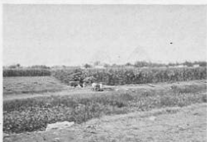
Great Pyramids of Giza

indifferent sexist and a fully-involved one is degree of control —of thought and of body . . . just as in the case of the indifferently-grown coffee beans being pyramided into buoyant flavor. Or it may be that pyramid power can keep us sexually active for longer periods without a need to conserve our strength . . . as in the case of the professor who is totally refreshed after less than two hours of sleep. Or we may find that nights of conical sleep and hours of conical meditation can give us a sharper sexual focus . . . as French yogurt is perkier in taste when conically contained.