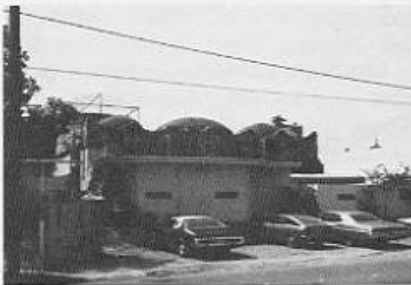
San Antonio Country Cocktail Lounge

The San Antonio Country Cocktail Lounge (often called Country) at 1122 N. St. Mary's is the largest and most impressive of the bars. It attracts a wild, zany and liberated young crowd, gay and straight. All types . . . black, white, Spanish, girls, military and lookers . . . pack its three bars. Twice a year they have a drag or semi-drag show. Hours are from 2 p.m. to 2 a.m. The best hours, though, are from 10 p.m. to 2 a.m. Dancing.