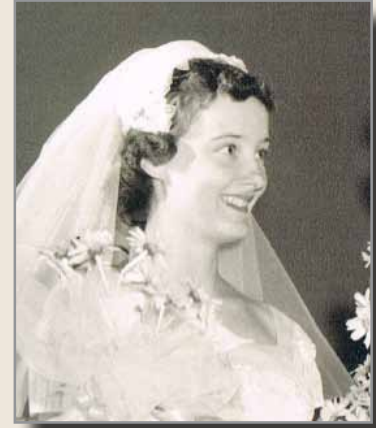
Young bride, 1959