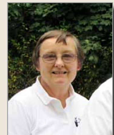
Age 72, 2011