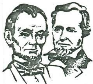
Abraham Lincoln & Joshua Speed

Bridge players mourning the loss of the Community Coffeehouse as their weekly "fix" can take heart because First Unitarian Church has started a Friday evening bridge program. The program was begun to "provide a social atmosphere for interested people in which they can feel relaxed." In addition, lessons in basic bridge are available. There is a $3 charge to cover basic utilities and space. First Unitarian Church is located at 5210 Fannin.