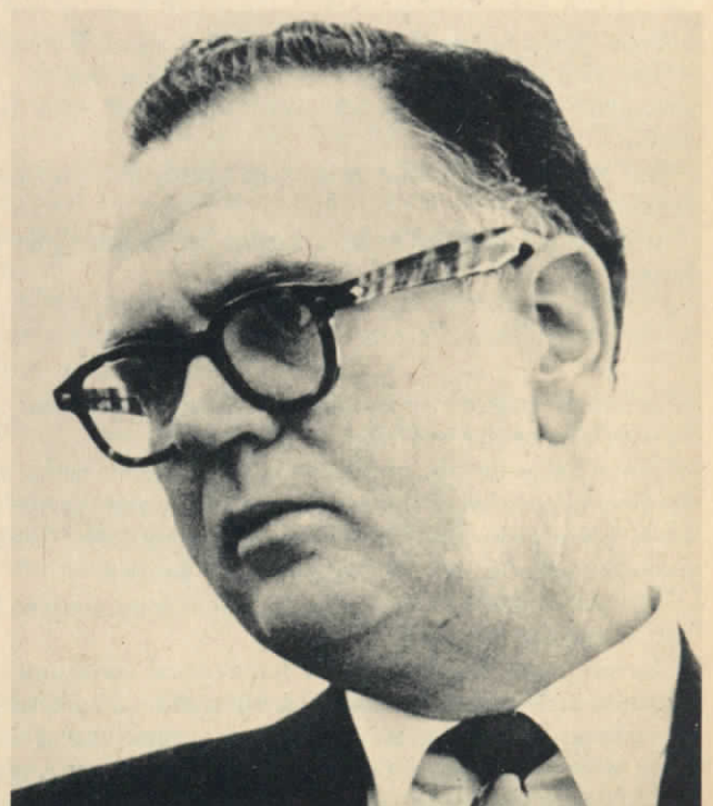
DISORDERLY AND INDECENT —At left is Washington's G Street YMCA, where ex-Special Presidential Assistant Walter W. Jenkins (right) was arrested on charge of "disorderly conduct (indecent gestures)."