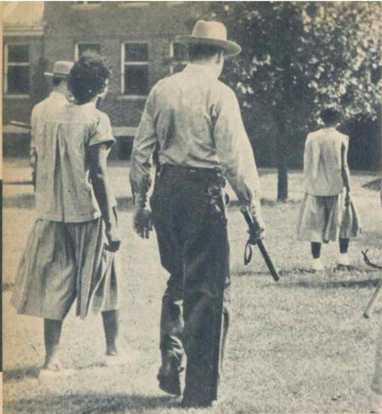
State troopers lead women rioters to new quarters after fight broke out between felons in Maryland Reformatory.