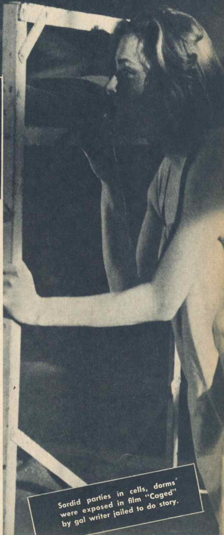
Sordid parties in cells, dorms were exposed in film "Caged" by gal writer jailed to do story.