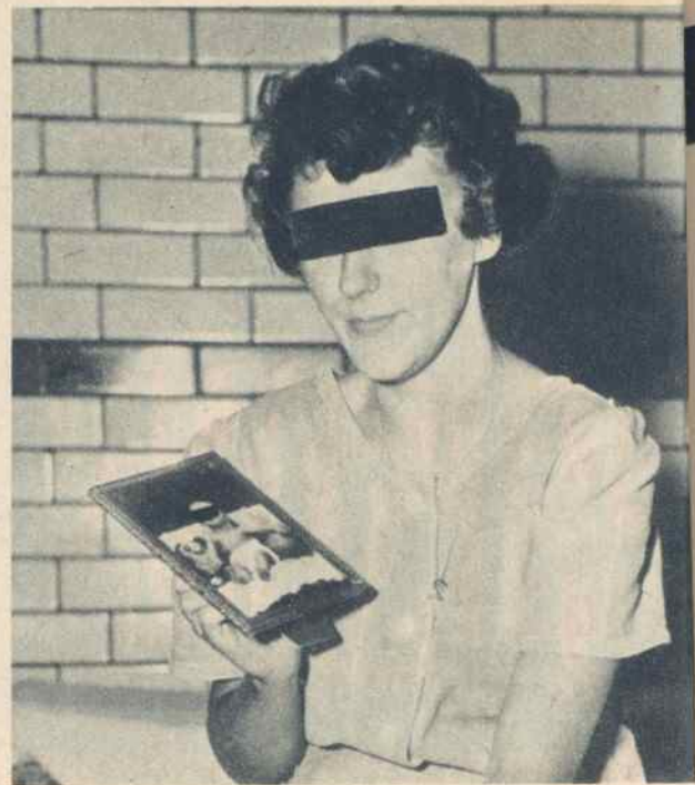
Most shocking indictment of conditions in womens' jails was 'test tube baby' conceived by inmate in Pa. prison.

Teen-aged delinquents and wayward minors too often get mixed up with prostitution and shoplifting gangs, who openly recruit them on their arrival.