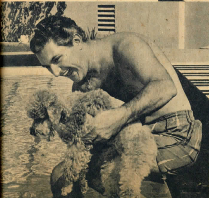
Just a happy boy with his dog, the Lib frisks with pet poodle Suzette.