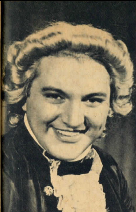
The Lib as Chopin. Inspiration for candelabra trademark came from an old movie based on maestro's life.