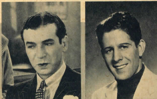
Just as Liberace is today, Harry Richman, left, and Rudy Vallee were targets at height of fame for joke-makers. Despite jests they're still top favorites.

The Lib, shown with devoted brother George, is ardent trencherman. He often consumes two dinners at sitting.