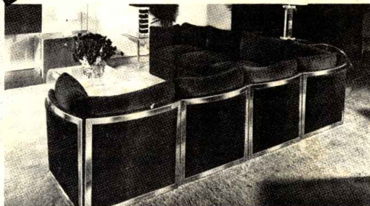
THE FOCAL POINT