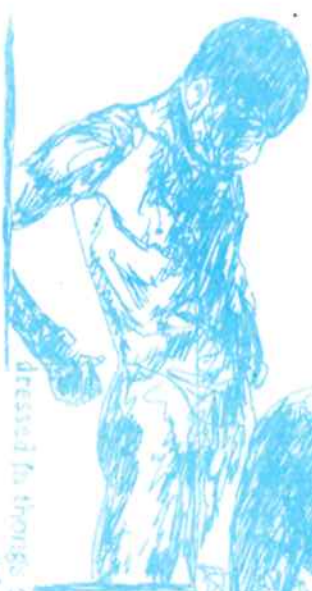
These in wade deep water exposing their rear end for friends to take pictures dressed in thongs and G-strings.