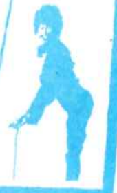
Galveston Daily News June 7, 1975