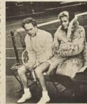
Sporty stud with jeune fille.

The years go by and Garfunkel becomes a successful