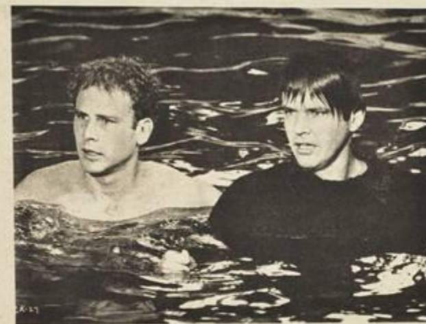
They poked their twangs in the same slot.

However, Nicholson decides that fucking girls with the right Hugh Hefner-scaled measurements should be his life goal. Since his college days take place during the fatuous fifties when the whole country was breast-fixated, it is no wonder that his ideal woman should fit the mold (or bra, if you prefer). Of course, he also believes that women are sex objects and that he is their master. Naturally his show of virility does attract women to him but his affairs don't last. "Ball-buster!" he screams as each one passes from the scene. Unfortunately, nothing really happens in Carnal Knowledge , which is the fault of writer Jules Feiffer.