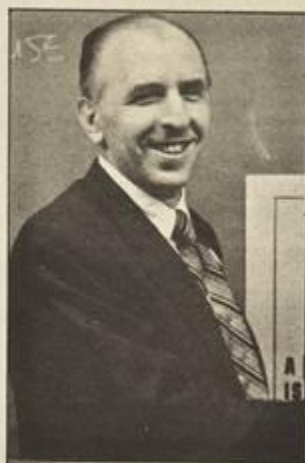
Dr. Franklin Kameny "Eliminate the Navy!"