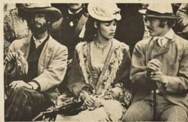
RICKY as Peter watches smugly as Barbra Streisand does her "Chicken Lick" routine—while CHRIS as Chlovisky tells GLENDA JACKSON as Nina: "By the way, are you aware your husband wears an iron ring through his foreskin?" hysterically hilarious (or hilariously hysterical) claustrophobic shots of Glenda Jackson rolling like drunken gelatin on the floor of an impossibly

1940's bio that featured Cornel Wilde as Chopin and Robert Walker as Brahms. (No one believed those story lines even then.) Russell has given us some interesting performances, elaborate decor, and two reels (approximately 20 full minutes) of nothing but the Piano Concerto No. 1, accompanied by some of the most exquisite visuals I have ever seen. (You are urged to leave the theatre at this point. You have already seen Chamberlain and lover fall ecstatically in bed together.) He is also nicely casual in his treatment of Tchaikowsky's homosexuality, per se refusing to leer and wag a finger. But he is not content with this commendable approach. No indeed. This is 1970 and we must show things as they really are, baby. No fragile, noble