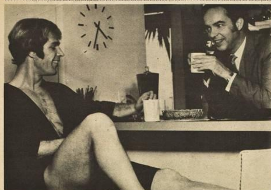
"Just what makes you so sure I'm gay?" From Hollywood Hustler, a Hercules Productions Inc. Release

A. Unfortunately, there are nothing BUT flaws in your situation. You cannot possibly hide a young Oriental friend in town where you are so well known. Was that letter really discovered by accident, or did you subconsciously wish it to be found by your wife? How long do you think an affair living in the shadows like a replay of BACK STREET can survive all the attendant guilt and fear and shame affecting the entire cast? It is really hopeless, as you suspect.