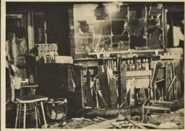
Police do $12,000 worth of damage to Christopher's End. Not satisfied with doing $1,000 worth of damage to the Psychedelic Shack and $20,000 worth of damage to The Haven, crowd-bar welding policemen recently rampaged through Christopher's End, destroying private property wantonly without due regard for the rights of property owners.

"With this move," says Mr. Terpstra, "The New Party becomes the first political party to incorporate into its platform the American Law Institute's proposed reform on so-called 'crimes without victims.'" The New Party considers its move a harbinger of change which will be followed by other political parties as soon as they catch up to the "Age of Enlightenment."