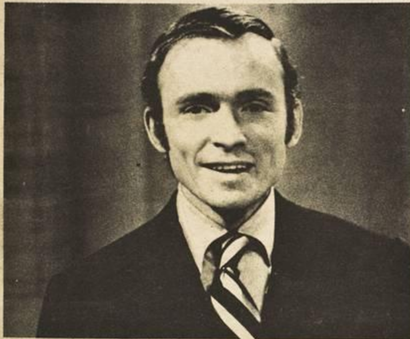
Dick Cavett—first network host for gays