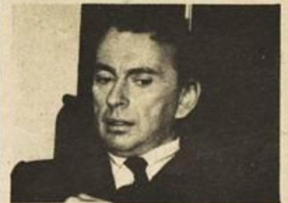
New Party co-founder Gore Vidal

It is a necessary step towards guaranteeing full individual freedom for all Americans regardless of race, color, creed, or sexual preferences. Persons who differ from the conventional in their private sexual orientation are entitled to political representation, as are members of minority ethnic groups. And, as a matter of hard, political fact, members of the "Gay