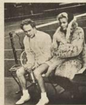
Sporty stud with jeune fille.

The years go by and Garfunkel becomes a successful