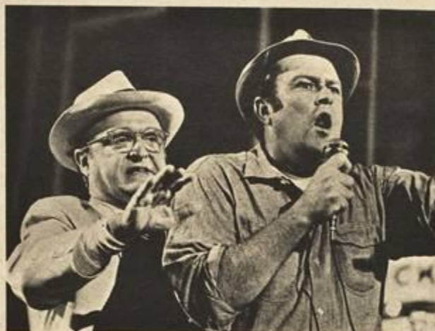
Ohio politics are handled with a certain... flair?

H ATE! isn't healthy. We all know it, but do very little to avoid it. Some even make a profession of it. I always feel guilty about Hate—(why play the enemy's game, even if it does feel so good?)—and try to limit myself to just one satisfyingly festering sore at a time. And it's much easier to concentrate on the individual subject. The only drawback: you must always have a spare loathing in cold storage in case your prime object dissolves. (I wandered around, a lost soul, for weeks after Joe McCarthy died.)