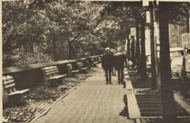
Central Park West: Graveyard cruising grounds

West Siders grew richer and/or more pretentious and moved to the Village or the East Side—or the suburbs. There was always a gay tenant to replace him. (Note to sociologists: why is there a new gay "generation" every five years? There was one in 1959-60, another in 1964-65, and we're still assimilating the 1969-70 one.)