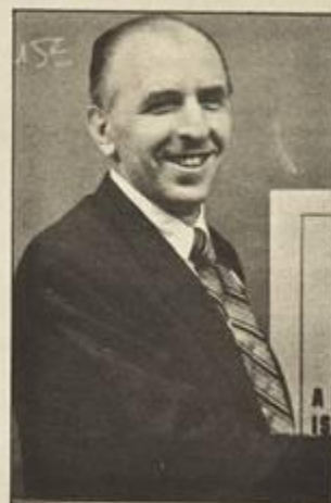
Dr. Franklin Kameny "Eliminate the Navy!"