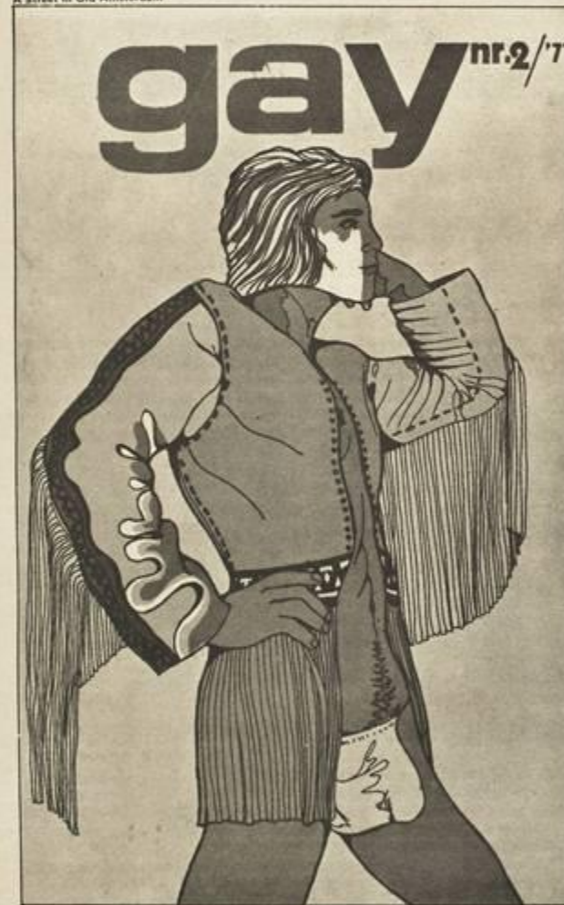
The Dutch publish their own version of "GAY"