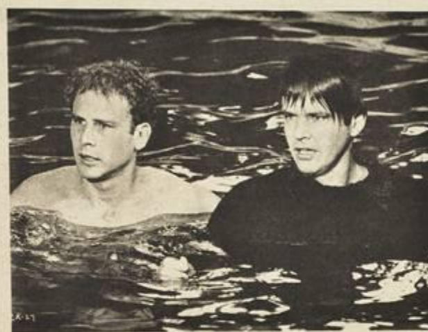
They poked their twangs in the same slot.

However, Nicholson decides that fucking girls with the right Hugh Hefner-scaled measurements should be his life goal. Since his college days take place during the fatuous fifties when the whole country was breast-fixated, it is no wonder that his ideal woman should fit the mold (or bra, if you prefer). Of course, he also believes that women are sex objects and that he is their master. Naturally his show of virility does attract women to him but his affairs don't last. "Ball-buster!" he screams as each one passes from the scene. Unfortunately, nothing really happens in Carnal Knowledge , which is the fault of writer Jules Feiffer.