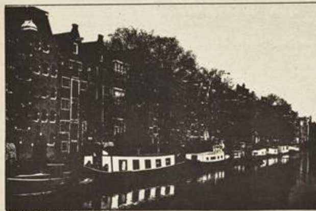
A Street in Old Amsterdam