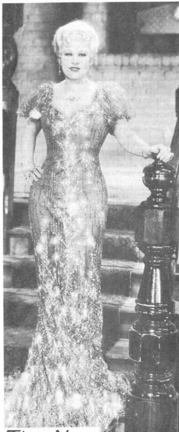
The New She Done Him Wrong , 1933.

The new painting of former President Eisenhower as the Mona Lisa with the 'famed smile' reminds me of some of our older ones in basic black and pearls.