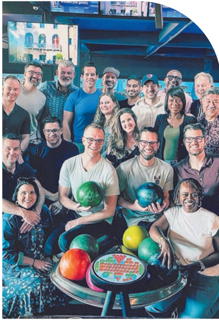
The Black Tie Dinner committee